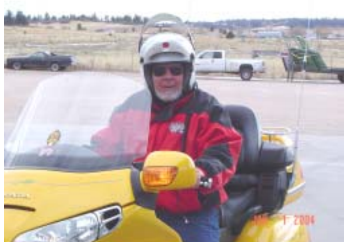
Thumper looking a lot like Santa