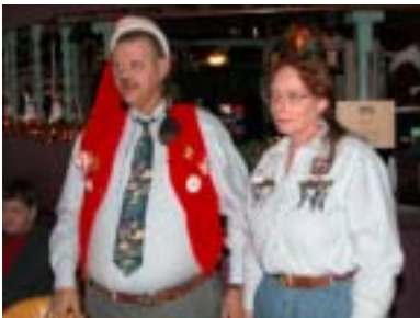
"Thanks" to The Activities Committee