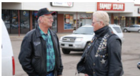
The "American Icon" and "Pipe Bender" discuss the ins and outs of winter riding.