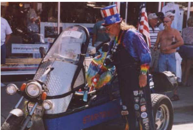
The old Star Trike is starting to show some age.