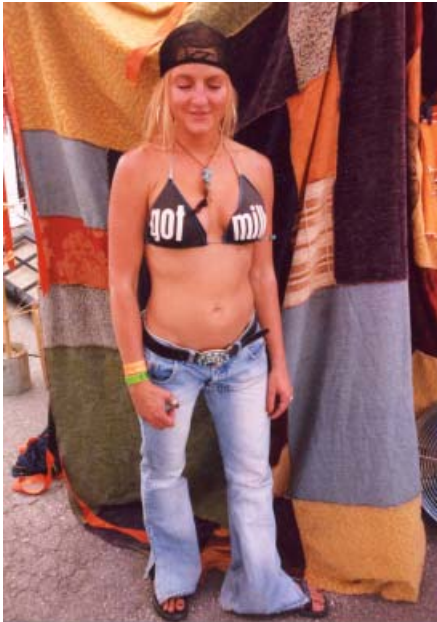
A representative of the American Dairy Association, I'm sure.