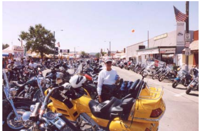
The Yellow Canary in a sea of Sceamin' Eagles.