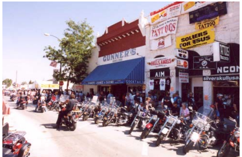
World famous Gunner's Bar on Main Street Sturgis.